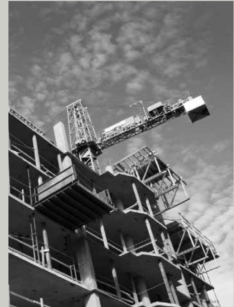
GROWTH IN PROPERTY MARKET IN AUSTRALIA