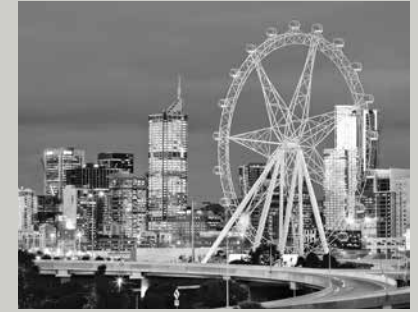
MELBOURNE STAR, DOCKLANDS

This special evening with entertainment will be held in a marquee within their beautiful garden, so dress for the weather, bring your dancing shoes and be ready to party.