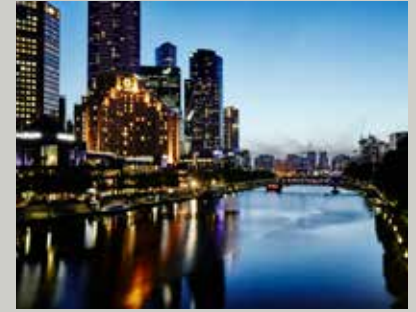
DINNER AND EVENING DRINKS, SOUTHBANK