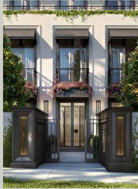
PALAIS TOORAK, LUXURY MULTI RESIDENTIAL PROJECT