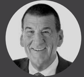
JEFF KENNETT DAY TWO

Jeff Kennett, is a former Victorian Premier and founding chairman of the highly successful national depression initiative BeyondBlue. In 2005, Jeff was awarded the Companion of the Order of Australia (AC) for his work within the Victorian Parliament, as well as his social and economic initiatives. His leadership further extended to the AFL arena where he was president of the Hawthorn Football Club from 2005-2011, and has since returned to the helm. An iconic leader, regarded as a boisterous philanthropist, whose unwavering commitment to community prosperity is nationally recognised.